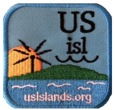
US Islands Patch

Members can come up and try out Yaesu's new FT-891 and Diamond's new HFV5 antenna on the island. The W/VE QSO party is open to all club members. We will giving out US Island patches to members who make island contacts this year from our club station.