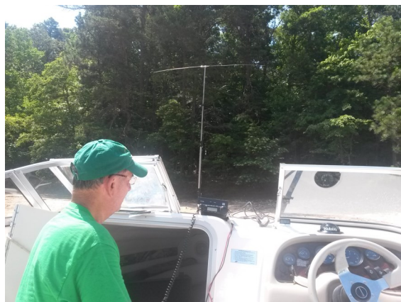
“Big Junction Island” GA042L

These Islands were worked at Lake Lanier using one of my boats on Thursday June 15.