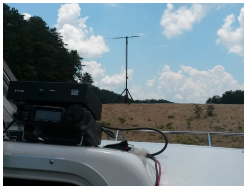
“Taylor Island” GA041L

These Islands were worked at Lake Lanier using one of my boats on Thursday June 15.