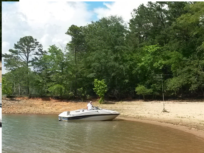
“Nix Island” GA040