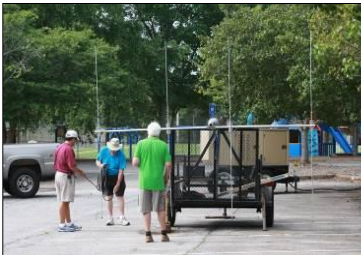
A four-element beam was one of the weapons in the VHF arsenal this year.

Six is a funny band in that when it is open it is really open and when it is closed, it is a pretty lonely place. This year’s station sported a 4-element 6-meter beam and a Yaesu FT-2000. This particular FT-2000 has been modified such that the first IF at 65 MHz has been brought out to a SMA connector on the back. This we used with a Funcube Dongle ProPlus and SDR# as a poor man’s panadapter. Bob Mantell, W4GA , referred to it as a “fish finder” and that has some truth in it. Our “fish finder” was pretty empty most of the time!