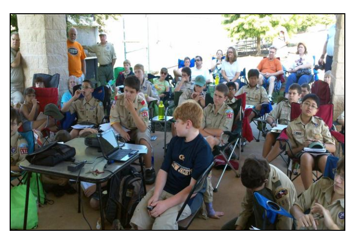
Boy Scouts work on their radio merit badges.