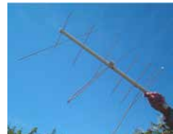
Learn how easily you can make your own satellite antenna