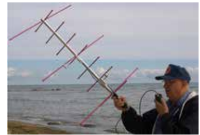
The Arrow Antenna.

If Fox-1 is heading directly toward you, the Doppler shift will be greatest, but except for passing overhead, it will change relatively slowly. Passes well to the east or west will have smaller maximum shift, but it will change continuously throughout the pass. Learning to compensate for this is a necessary operator skill. Using the recommended full-duplex operation will allow you to hear if you are tuned on-frequency.