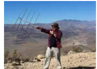
The ELK Antenna.