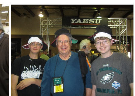
Acting up with Yaesu caps!