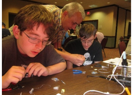
At QRP buildathon w/AC4PA